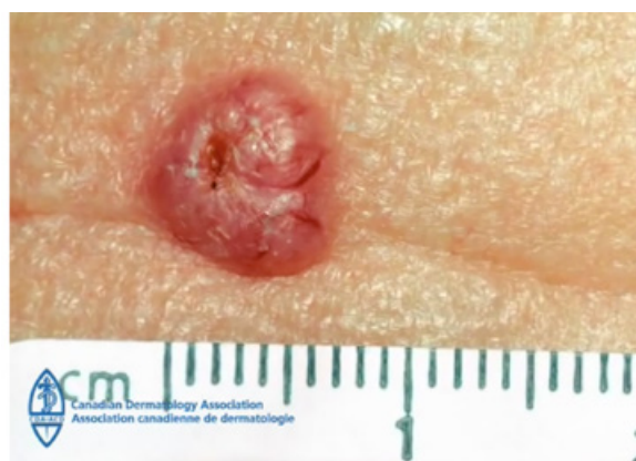
Spotting skin cancer video on YouTube