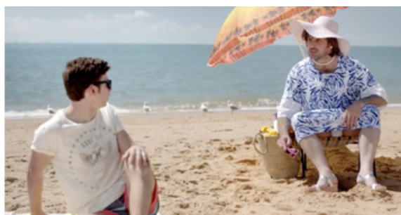
Sun Mum at the beach video on YouTube

There are no right or wrong answers, but give the handout Fact file D: Five ways to be sun safe to show the messages supported by cancer councils and the Australian government (often 'slide' on sunglasses and 'seek' shade).